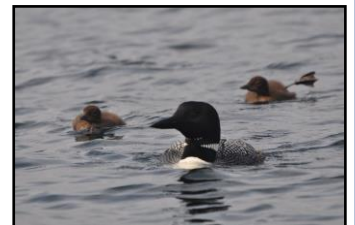
Stretching our Legs

Charleston Lake clothing is also a lake essential. We order a new style and cut every season so be sure to stop by and check out the latest Charleston Lake style, exclusive to Lakeline.