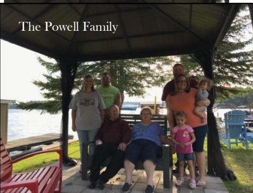
The Powell Family