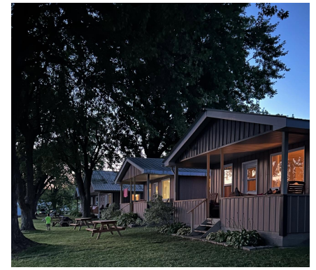
Steel siding on the cottages adds a more natural, updated look to the property.

- THE STAFF AND IRELAND FAMILY AT LAKELINE LODGE